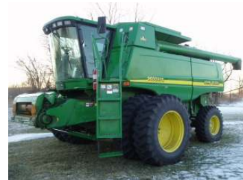
2001 John Deere 9650STS 3,567 h | 2,505 sep h | $85,000 (HR)