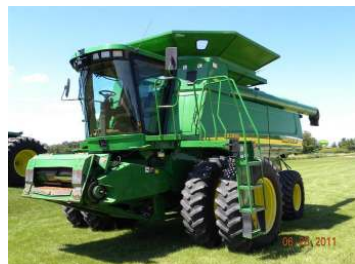
2000 John Deere 9650STS 3,512 h | 2,515 sep h | $82,500 (HM)