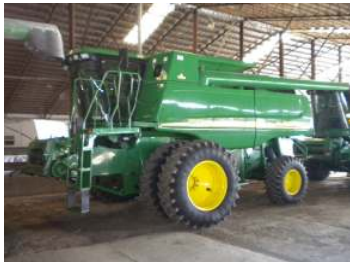
2004 John Deere 9660STS 2,767 h | 1,888 sep h | $125,000 (HR)