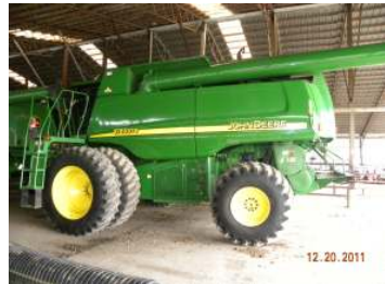
2004 John Deere 9760 2,895 h | 2,071 sep h | $142,500 (HR)

CHECK OUT OUR YEAR-END USED COMBINE DEALS!