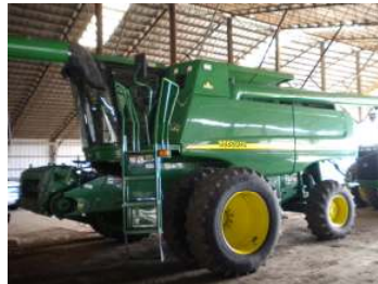
2004 John Deere 9660 STS 2,439 h | 1,640 sep h | $141,500 (HM)