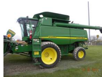
2005 John Deere 9760STS 2,242 h | 1,626 sep h | $139,500 (HM)

CHECK OUT OUR YEAR-END USED COMBINE DEALS!