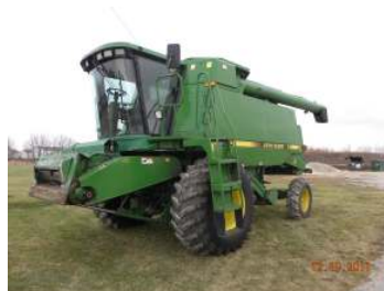
1991 John Deere 9500 6,341 h | 4,198 sep h | $31,500 (HM)