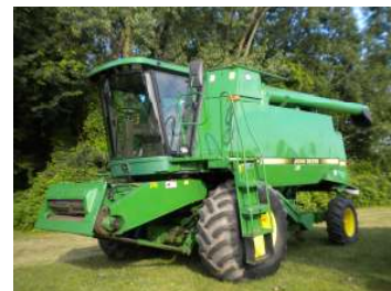
1990 John Deere 9500 5,933 h | 3,996 sep h | $32,500 (HR)