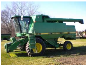
1995 John Deere 9500 3,591 h | 2,461 sep h | $37,500 (HR)