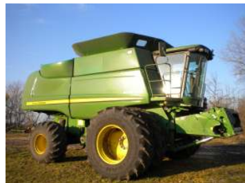
2008 John Deere 9770 STS 1,500 h | 1,086 sep h | $200,000 (HM)